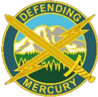
56 th Information Operations Group Joint Base Lewis-McChord, WA