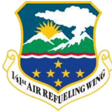
141 st Air Refueling Wing Fairchild Air Force Base, WA