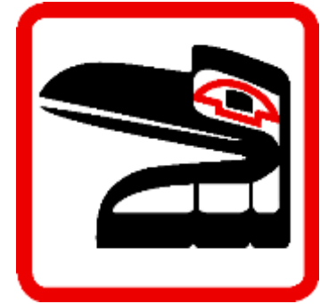
81 st Stryker Brigade Combat Team Seattle, WA