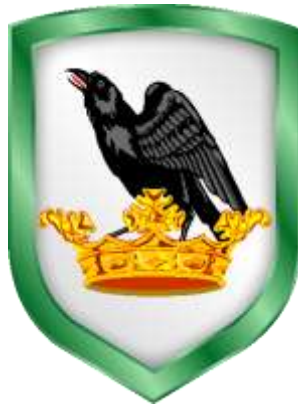
96 th Troop Command Camp Murray, WA