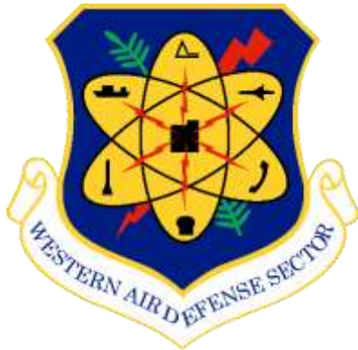
Western Air Defense Sector Joint Base Lewis-McChord, WA