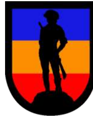
205 th Regional Training Institute Camp Murray, WA